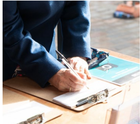
Exhibition, November 2018