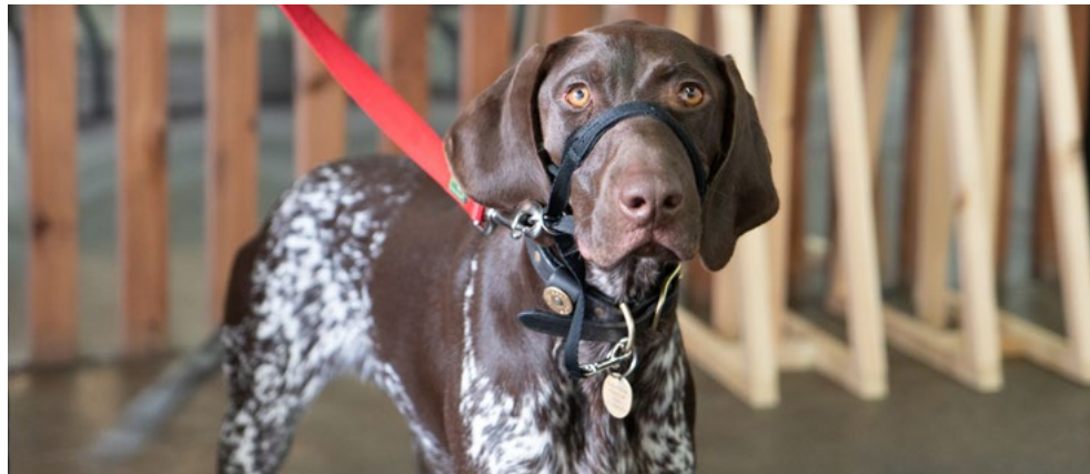
Exhibition, November 2018