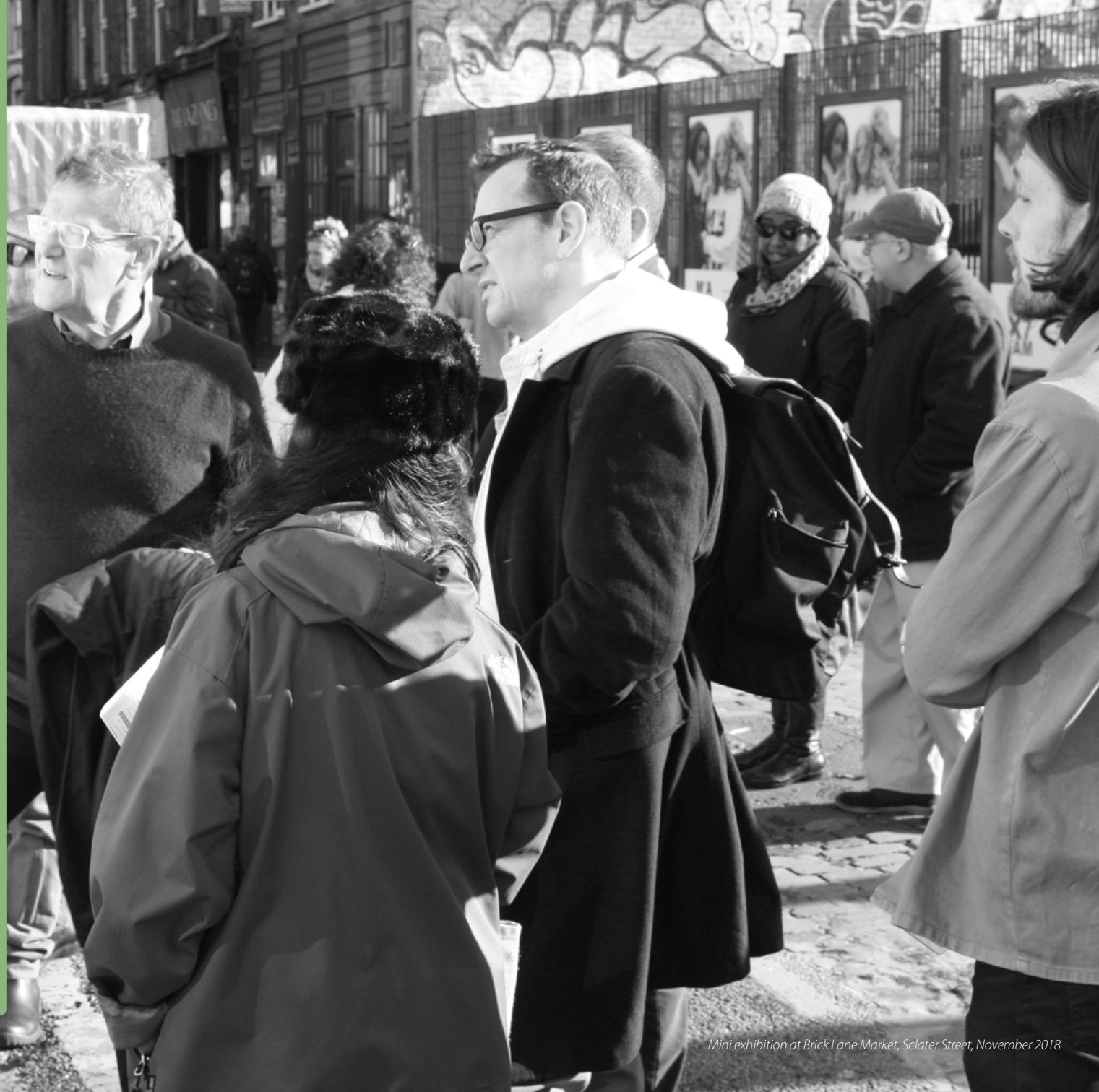
Mini exhibition at Brick Lane Market, Sclater Street, November 2018

AN OVERVIEW OF WHAT HAPPENS NEXT, THE AMENDED PLANNING APPLICATIONS, STATUTORY CONSULTATION AND RECOMMENDATIONS