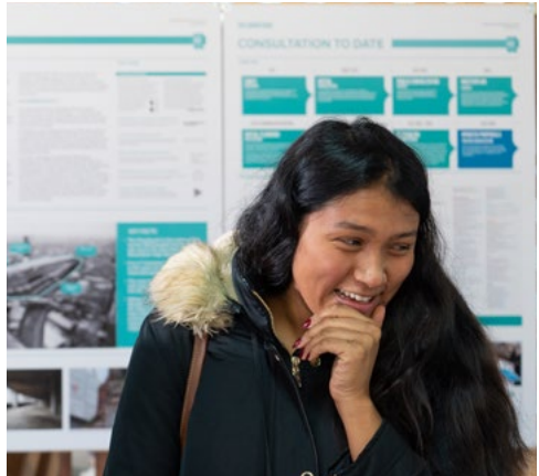
Exhibition, March 2019