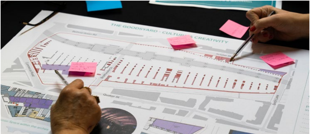
Theme Exchange, November 2018 Page 76

The outline planning applications will determine the quantum of development, location of buildings and their maximum height and mass. It will also cover access points, routes through the site and the design principles for the new buildings, streets and public spaces. All outline designs will be subject to subsequent and further reserved matters applications. In the case of the Goodsyard, full details are being provided for the listed structures on the site, in addition to applications for listed building consent for works to these structures. Along with detailed applications for Plot 2 by Eric Parry Architects.