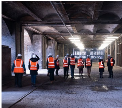
Site tour, March 2019